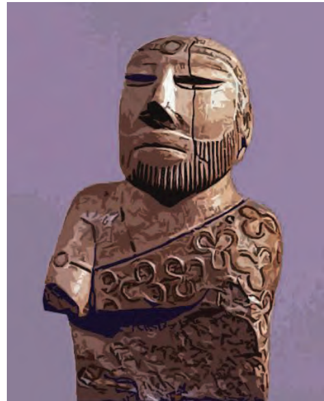
A specimen of Harappan art

A statue found at a Harappan site presents an excellent specimen of their art. It shows the man's facial features very clearly. A cloak with a beautiful trefoil pattern is draped across his shoulder.