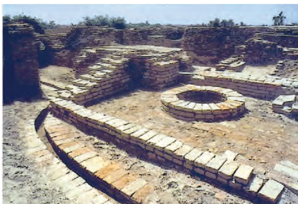
Harappan Civilization well

The streets were broad and laid out in a grid pattern. Houses were built in the rectangular blocks created by them.