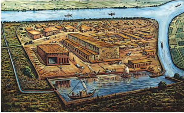
An artist's visualization of the dockyard at Lothal (Reconstructed with the help of the remains)