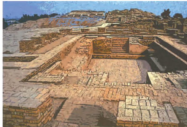
The Great Bath at Mohen-jo-daro

A spacious bath has been discovered at Mohen-jo-daro. The tank in the Great Bath was nearly 2.5 metres deep. It was 12 metres long and 7 metres wide. It was lined with baked bricks to prevent seepage of water. There were steps leading down to the tank. There was also a provision for draining, cleaning and re-filling the tank from time to time.